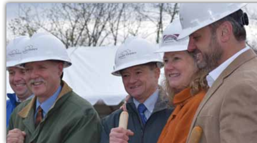
Ground Breaking ceremony for Allard Square on November 1st, 2017, funded in part with the New England Federal Credit Union's grant. 39 senior households will call Allard Square home thanks to the New England Federal Credit Union and other funders.

VHFA provided financing for 18 affordable housing projects across the state in FY2017, allocating over $75 million in federal and state tax credits and private investments for 823 rental housing units.