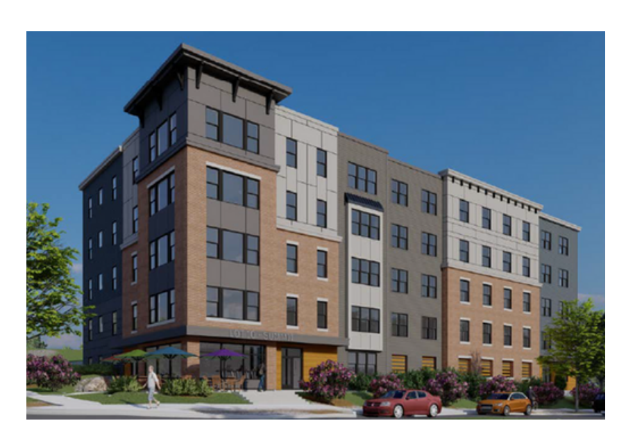
Rendering of O'Brien Farms building, courtesy of Summit Properties

The project features access to walking paths, gardens, and a pocket park within the O'Brien Hillside Community as well as convenient access to public transportation routes. The development will include both single and multifamily homes to create a diverse, inclusive community. The O'Brien Farms project is expected to be completed by December 2023.