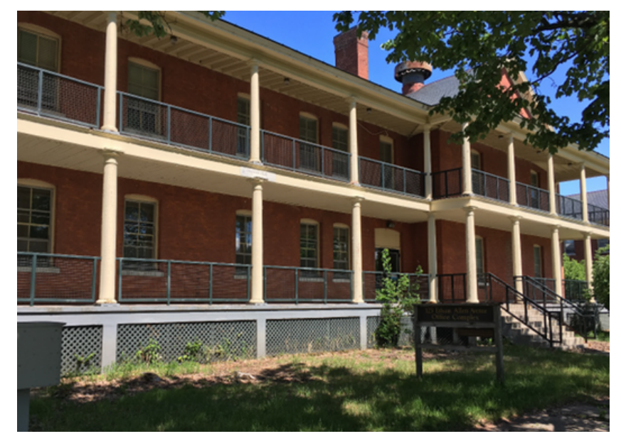
Exterior of buildings at Fort Ethan Allen.

However, VHFA staff have identified a long-term gap in permanent debt needed to complete the project. They have recommended that the project receive a $300,000 0% loan from the VHIF. Principle payments will be made annually towards the VHIF loan, allowing funds to be recycled into other projects.