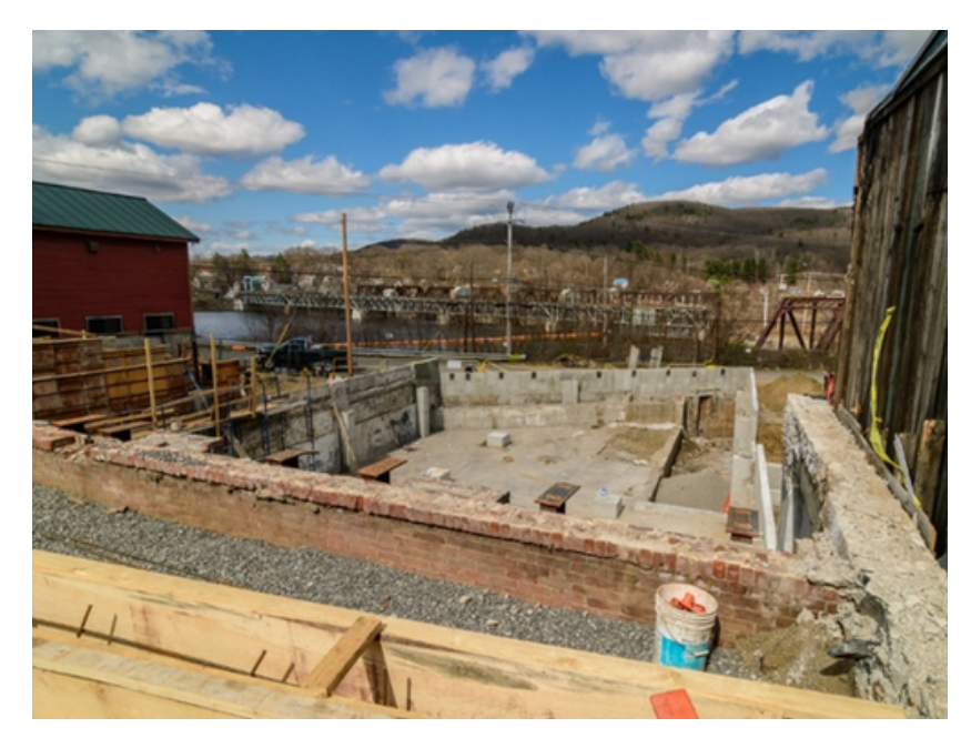
Construction site at Bellows Falls Garage.

Tuttle Block in Rutland closed on their construction loans and are commencing the rehabilitation work on the existing units and converting Housing Trust of Rutland County's former office space into new units. Housing Trust of Rutland County has relocated their offices to another commercial space in Rutland that was previously vacant, helping to balance the residential and commercial markets in the community.