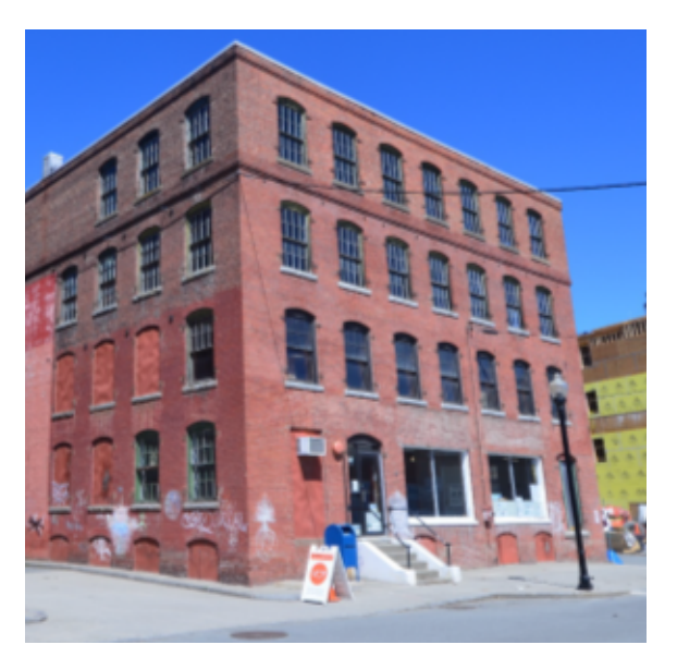
DeWitt Building in Brattleboro

Construction has begun at Bellows Falls Garage in downtown Rockingham. The project has overcome significant challenges with state historical and environmental programming as well as pandemic related delays. The previous blighted historic building will be repurposed from a garage to 27 mixed income apartments with a commercial space on the ground floor. Construction is anticipated to be complete in spring 2023.