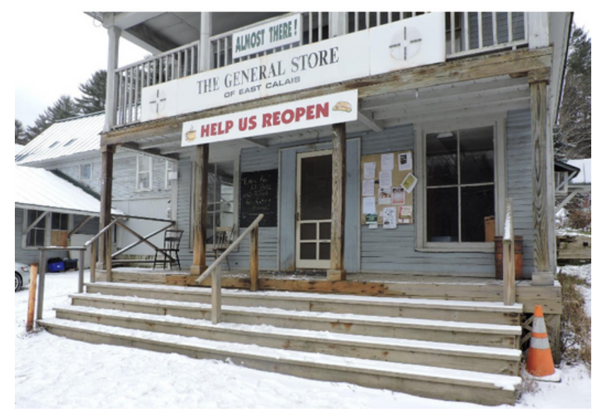
East Calais General Store building.

There will be three rental units above the store, one to be rented at market rate, one targeted to 80% AMI, and one targeted to 60% AMI.