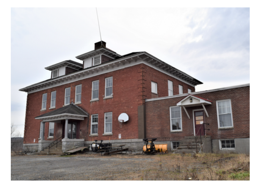
Historic Ward 5 School in Barre.

The apartments are targeted to serve households earning the area median income or less, including seven units at 60% AMI, 11 at 50% AMI, and six for very low-income households earning 30% AMI or less. 14 apartments have project-based rental assistance.