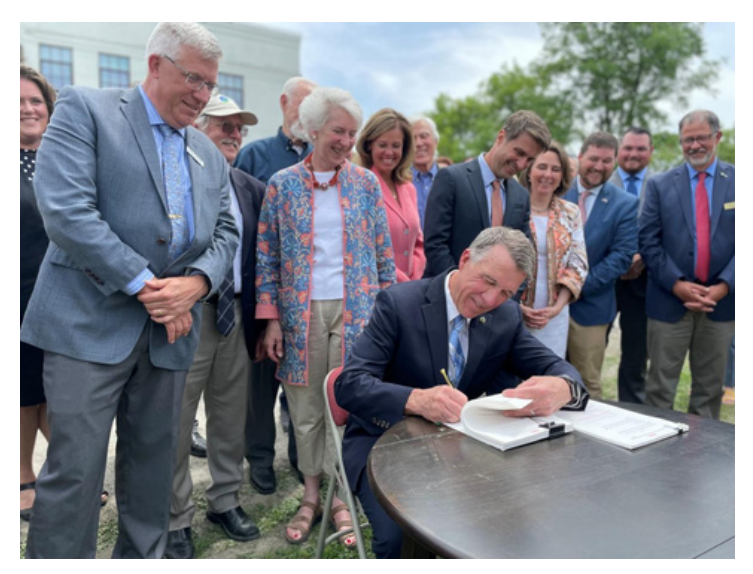
Governor Phil Scott signs housing legislation at Salisbury Square.

The VHIF award will support the 12 new rental units. Five apartments will be targeted to household earning 60% AMI, two targeted to 50% AMI, and three targeted to 30% AMI. The building will be developed to Net Zero high performance home standards including rooftop solar arrays. The project has also received <u>a Congressional Directed Spending award from Senator Bernie Sanders</u> to build out their solar and electric storage via an innovative micro-grid approach.